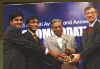
ACCOMODATION TIMES BEST PROJECT OF THANE 2007