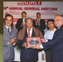
MCHI LIFETIME ACHIEVEMENT - 2010