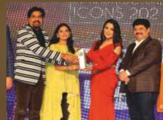
BEST LUXURY PROJECT OF 2021 - MIDDAY INTERNATIONAL DUBAI ICONS