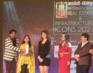
BEST TOWNSHIP DEVELOPER OF 2021 - MIDDAY INTERNATIONAL DUBAI ICONS