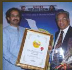
NAVBHARAT TIMES UDAAN - 2011