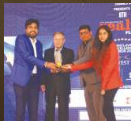
BEST TOWNSHIP 2016 - REALTY PLUS