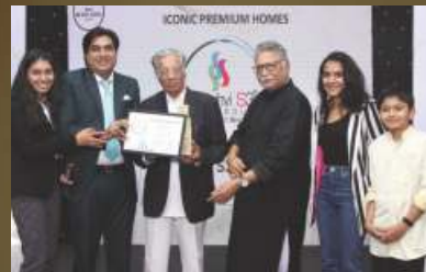
TIMES REALTY ICONS - 2019