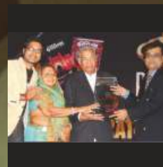
PRIDE OF GUJARAT MAHARASHTRA - 2011