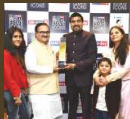
MID-DAY ICONS 2016