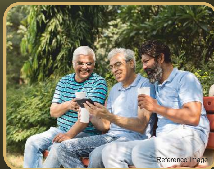
SENIOR CITIZEN ZONE