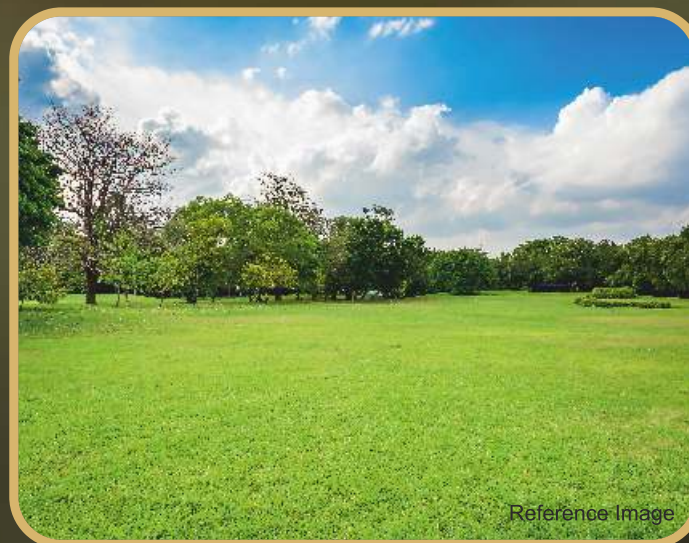
GREEN LAWN & LANDSCAPE GARDEN