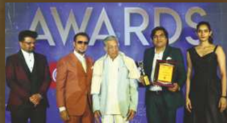
REAL ESTATE & BUSINESS EXCELLENCE 2020 - CNN NEWS