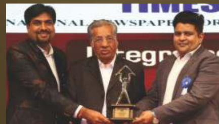
BEST TOWNSHIP 2015 - ACCOMMODATION TIMES