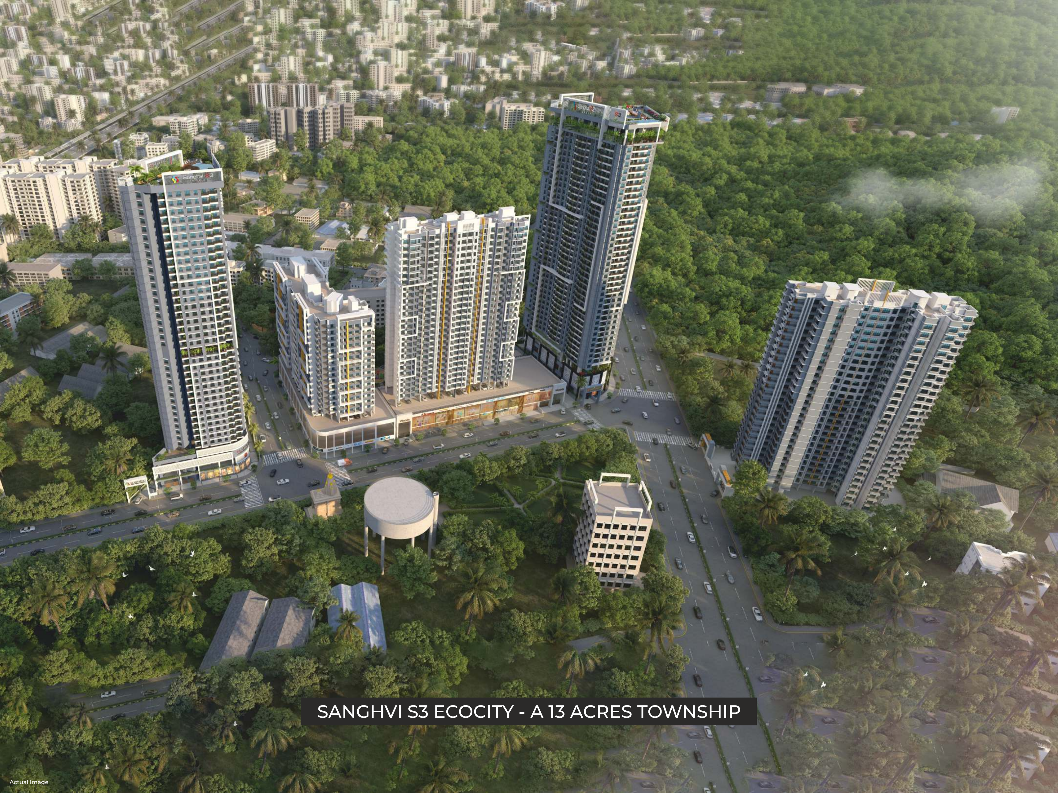
SANGHVI S3 ECOCITY - A 13 ACRES TOWNSHIP