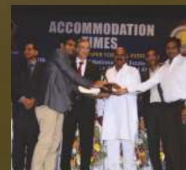
BEST REDEVELOPMENT PROJECT - 2012