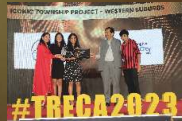
ICONIC TOWNSHIP PROJECT - WESTERN SUBURBS TIMES AWARD 2023