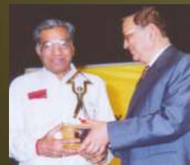
ACCOMMODATION TIMES AWARD MASS HOUSING COMPANY 2005