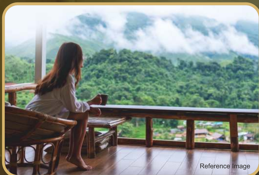
SUNDECK WITH NATIONAL PARK VIEW