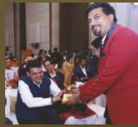
LOKMAT CORPORATE EXCELLENCE 2017